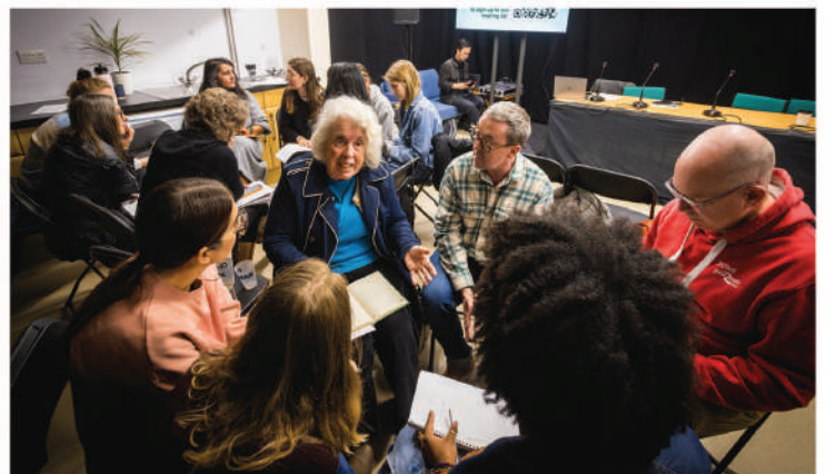
Participants at Producer Gathering, West Green Studios, Image by Ian Greenland