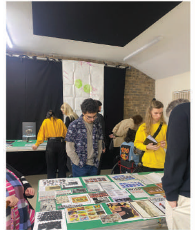
Clod Ensemble's Archiving workshop, West Green Studios