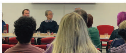
Creative Health workshop with The Hera Project, Charis Centre

Inclusive Facilitation with Access All Areas