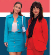
Maple & Mosely, Breakfast Scene, image by Leyla Güler