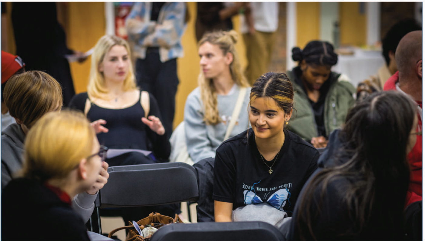
Cohort members at Producer Gathering, West Green Studios.

“ It was so helpful having workshops from different creative professionals, such as Matt Turner, Brightblack and Dizzy, to showcase the variety of options there are for creative work. – Skills Exchange cohort