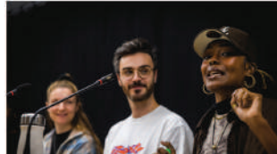
Producer Gathering speakers, West Green Studios.

practitioners who take an experimental approach to their creative practice. It encouraged participants to step out of their comfort zone and try new things.