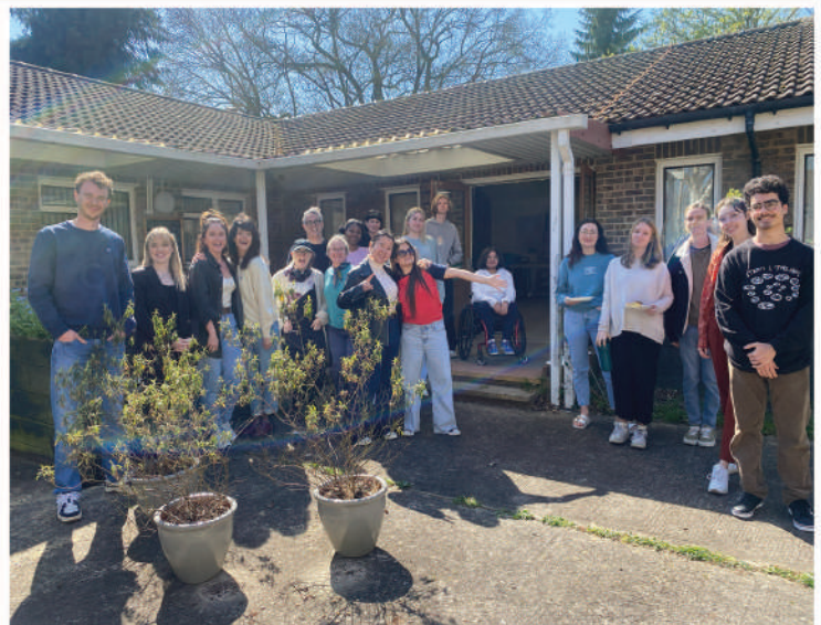
The Cohort and Resident Artists, West Green Studios