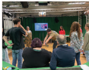
Cohort at the Access All Areas workshop, Unit 79/80 County Mall. Image by Charlotte White

Meeting professional artists brought the cohort practical guidance and valuable insight into what it really means to work in the creative sector. Our evaluators (RMR) observed the following positive impacts on the cohort: